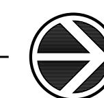
LOCATION PLAN SCALE: N.T.S.