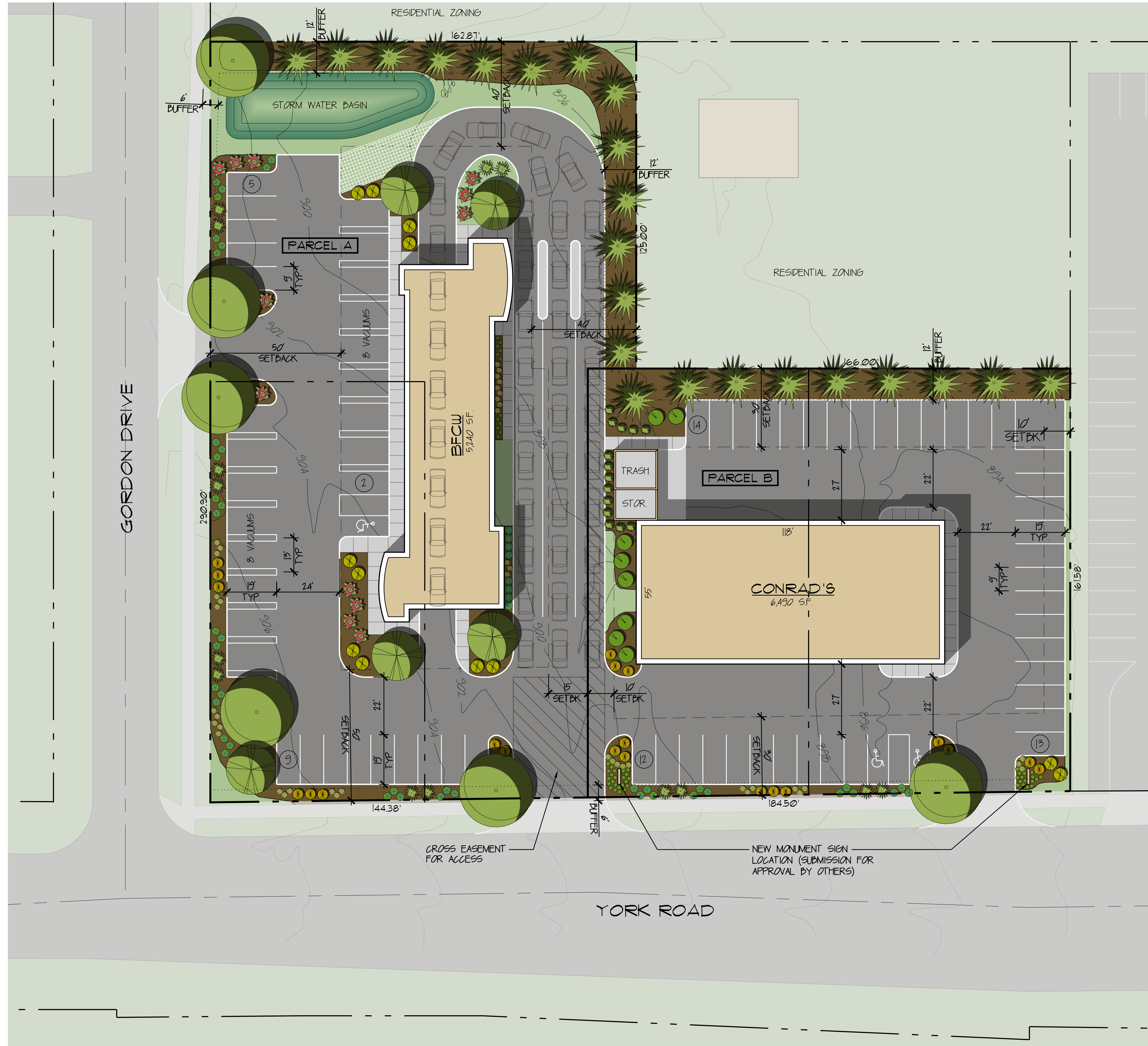
SITE PLAN SCALE: 1"=40'-0"